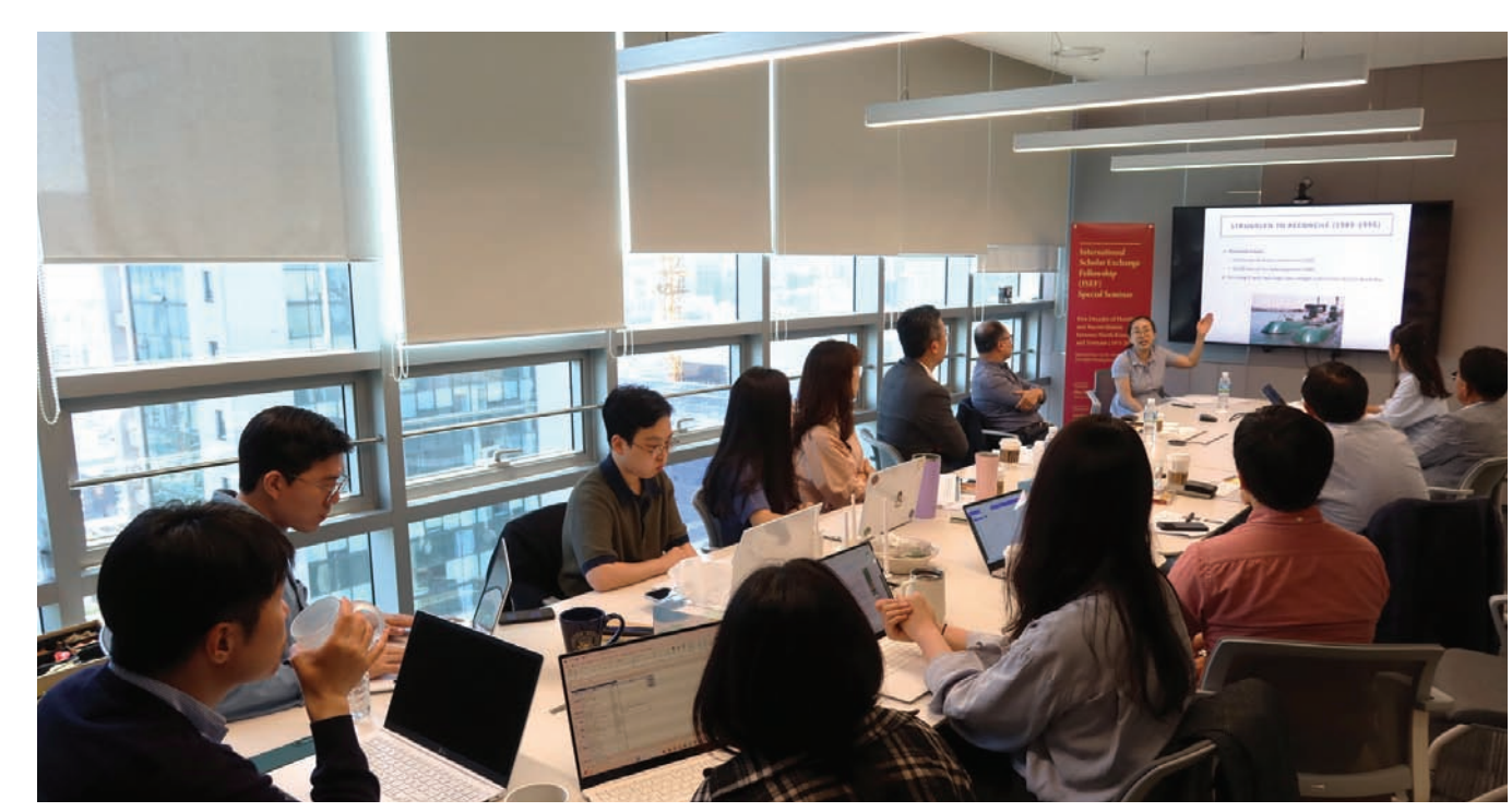
ISEF Special Workshop

Eligible applicants must first go to the Chey Institute website (www.chey.org) - Exchange Programs - ISEF - Apply -Application page and click the "Apply" button to proceed with Email Authentication