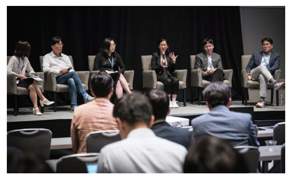
UKC Deep Tech Forum