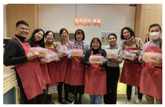
Korean Language Class