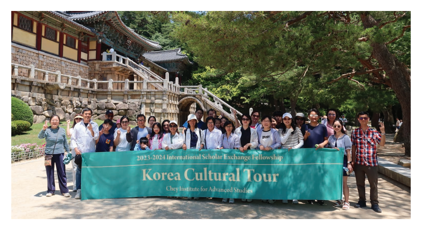
ISEF Cultural Tour

6_ International Scholar Exchange Fellowship 2025-2026