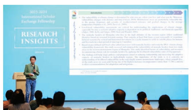
ISEF Final Academic Seminar

• If available, please attach a letter of research affiliation from your host institution in Korea to your application. You may