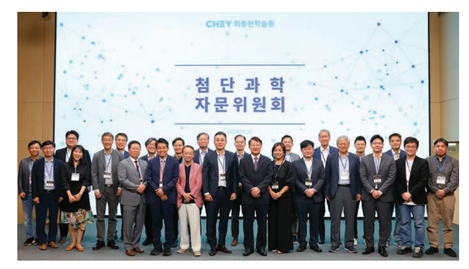
CHEY Advisory Committee on Science and Technology