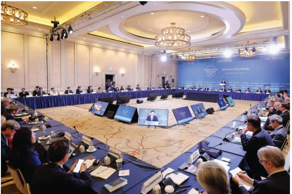
Trans Pacific Dialogue

Building on 25 years of fostering academic collaboration and supporting over 1,000 fellows from Asian countries, the