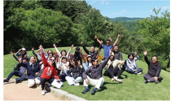
Visit to SK Afforested Plantation